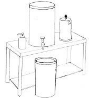
Hand Wash Station

For additional information visit health.mesacounty.us .