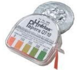
Quaternary Ammonia 100-400 ppm

Always use test strip to test sanitizer concentrations.