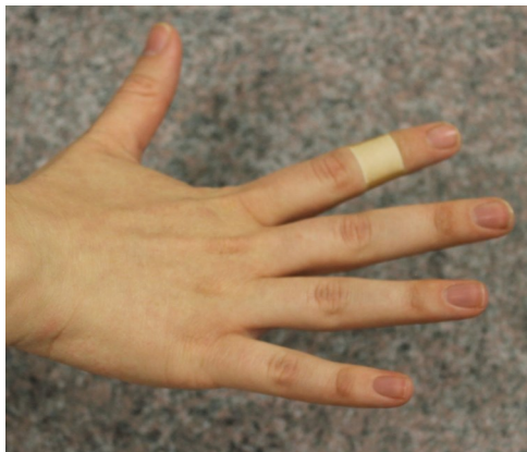
Step 1: Bandage