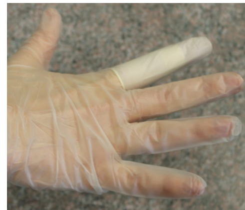
Step 3: Wash hands and cover with a glove