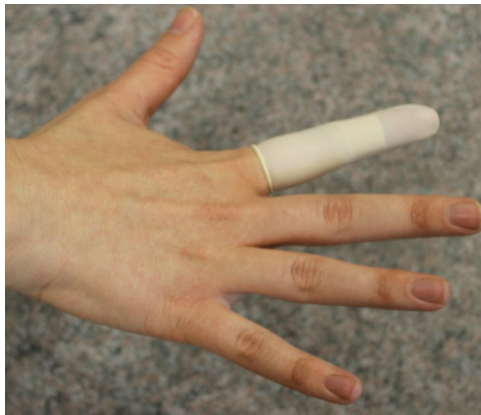
Step 2: Cover with impermeable layer